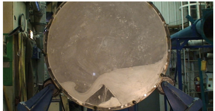
The image above shows the testing of a bed disturber (aka a mixing flight) with a talc material. The goal of the test was to determine how well the talc was being mixed as a result of the bed disturber. In a process setting, this would ensure uniform temperature throughout the bed.

Visual Analysis - To determine the impact of the selected variables on the material behavior; is the material showering or discharging in clumps; is