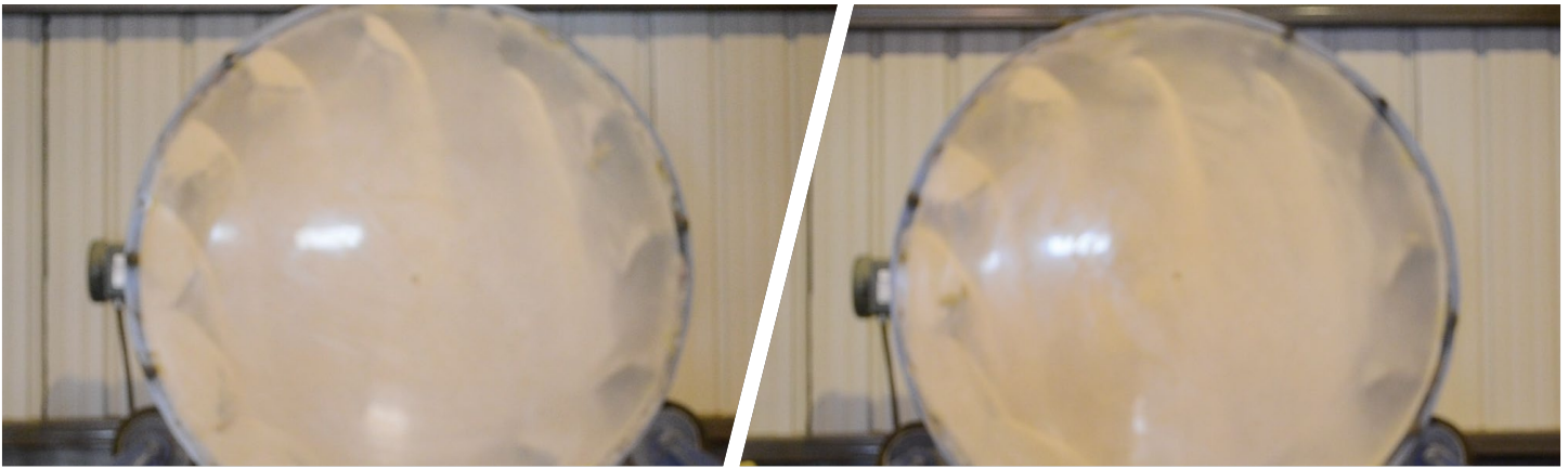
The pictures above show the same lifter configuration at two different rotational speeds. The picture on the left shows a good distribution of solids across the width of the unit. The gaps seen in the picture would be filled in by off-setting the lifters. In the picture on the right, the rotational speed is increased and the lifters empty later, giving a poorer distribution.

for visual observation throughout the testing process.